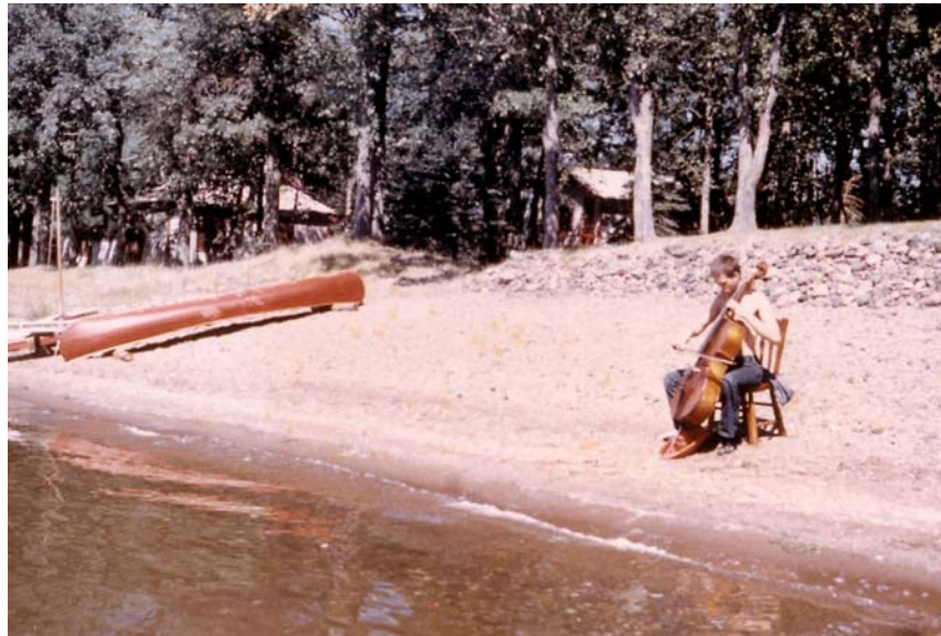
Arthur Russell playing cello on a beach in Minnesota, circa September 1971.