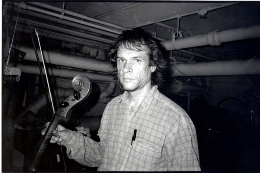
Arthur Russell and his cello in the mid-1980s.

and took to retreating into a closet in order to play the cello, not because (as some have written) playing was forbidden, but because the acoustics were so powerful he was able to forget the distinction between himself and his instrument. That sense of being both decentered and expanded was set down on World of Echo , where voice and instrument twisted around each other in such an interactive, ethereal manner it is impossible to think of them as individual components. Capturing two live performances of these recordings on video, the experimental musician and filmmaker Phil Niblock kept his shots so tight that Russell's body is never seen in full, instead appearing as a series of interacting parts — the movement of the hands, the body of the cello, the meeting of the bow and the strings, the tilt of the head — as if providing a tour of the various components of the recording assemblage rather than a representation