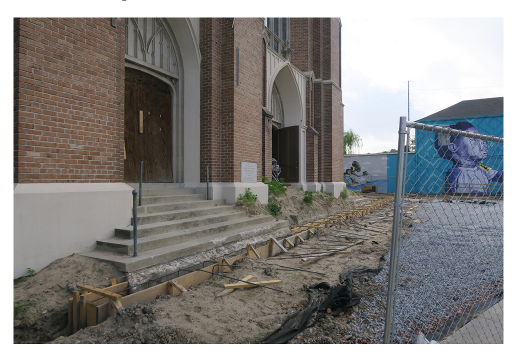
Fig. 6: The emerging entrance of the new Southern Rep Theatre, April 3^{\rm rd} 2018.