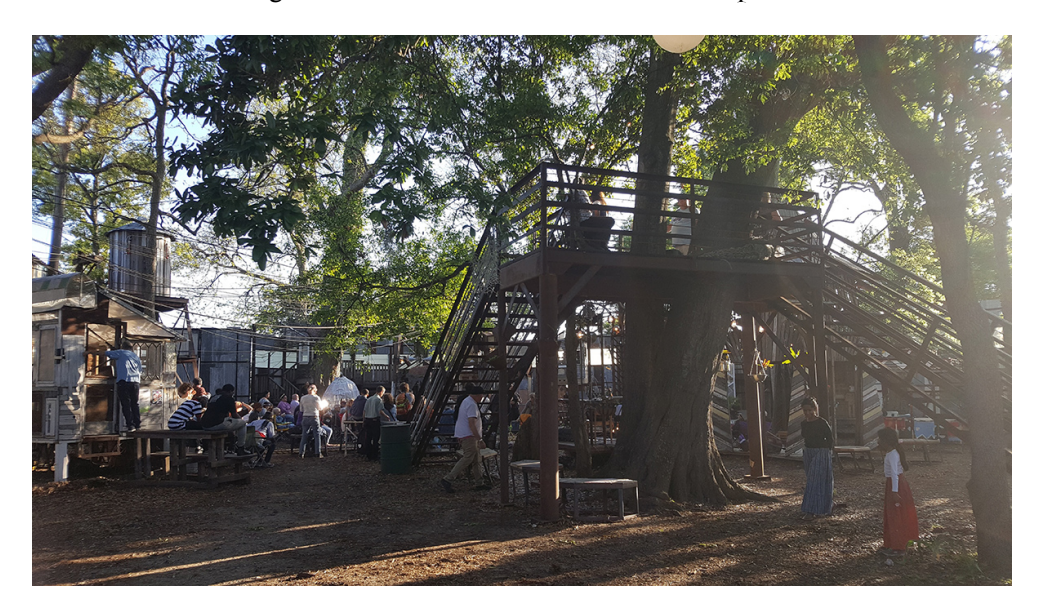
Fig. 5: Interior and raised viewing platform in the Music Box Village, March 31st 2018.

uncertainty makes us uneasy that we might have this all wrong, that we may have mixed up the location. That said, we're reassured by the presence of people moving this way. It's not exactly a crowd, but we join a stream of people, in pairs and small groups, heading towards the end of the road. We cross the ground to the left, passing in between and beneath the canopy of trees, to a building that lies well back from the road. There is a sense of disconnection between the order of the roads, of satellite navigation systems, and the building, which we remember as being only partly visible from the houses on the street. Stopping briefly at the box office, and a table where our tickets are checked, we work our way around the structure, through a wide entrance, into an enclosed, open-air interior.