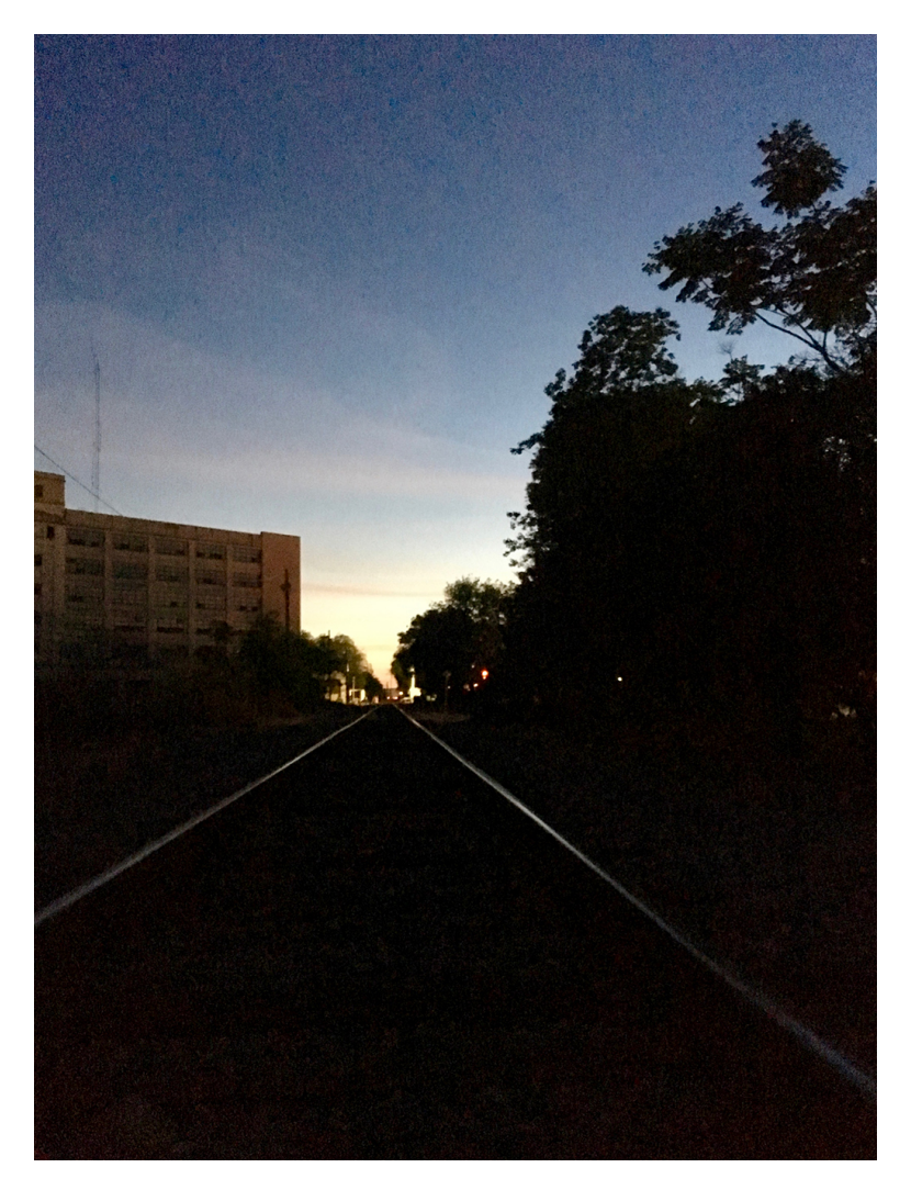
Fig. 7: Railroad at the Music Box Village, March 31st 2018.

approaching resilience challenges through performance, we can consider the ways in which architectural decisions are made in appropriating a building to speak to the communities that surround them, offering an invitation to use the building as gathering place, performance venue, impromptu workspace, or simply a place to people watch.