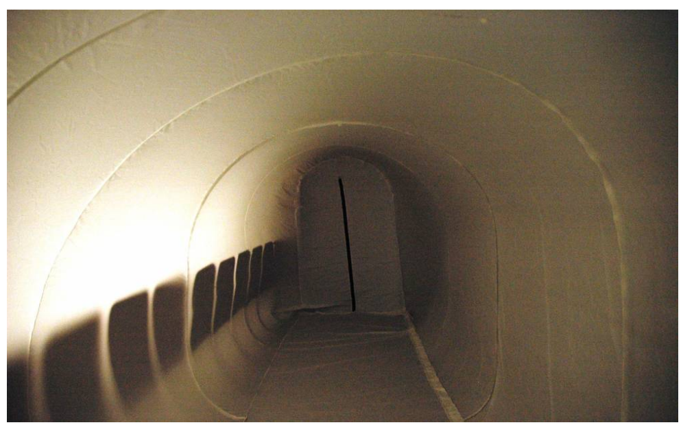
The Totum One Entrance Tunnel.