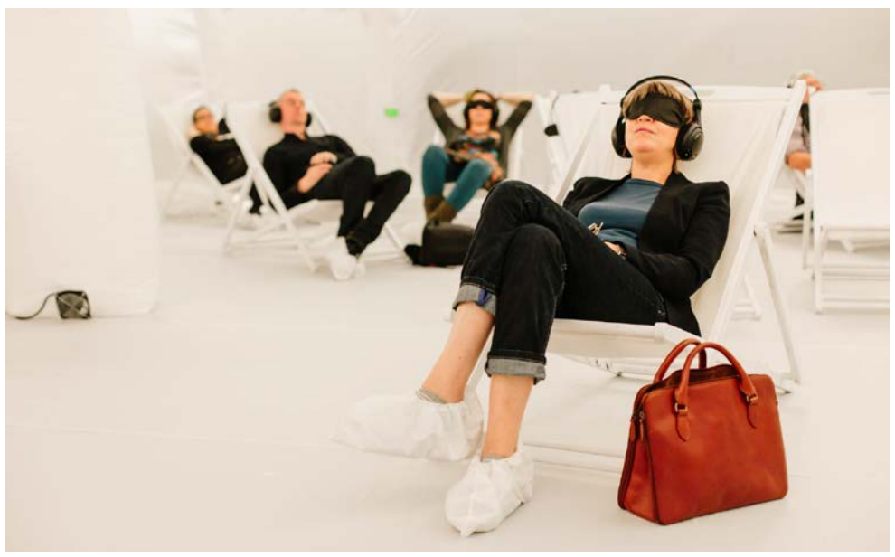
A Borderlands Audience.